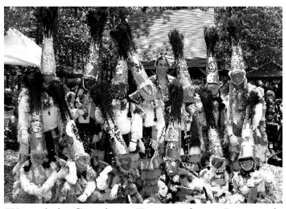
Warwick Gombey Troupe from Bermuda

In Inwood Hill Park, we find the only remaining oldgrowth forest and natural salt marsh in Manhattan. As long as 3,000 years ago, it served as a bountiful place for hunting and gathering. Here, Drums Along the Hudson connects the past and the present – the ancient traditions of New York's first inhabitants and the richness of contemporary Native American culture.